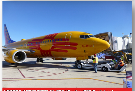
LEKTRO AP8950SDB-AL-200 / Boeing 737 Push-back