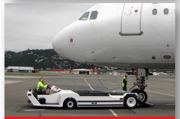
LEKTRO AP8950SDB-AL-200 / Air New Zealand Airbus A320