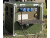
POWER BANK FOR PAPI