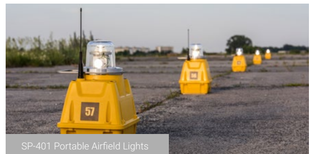
SP-401 Portable Airfield Lights