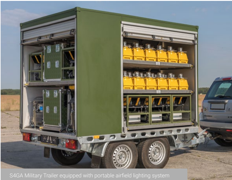
S4GA Military Trailer equipped with portable airfield lighting system