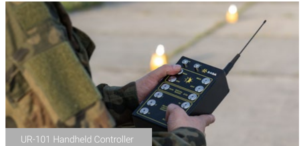
UR-101 Handheld Controller