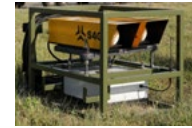
PORTABLE PAPI LIGHT