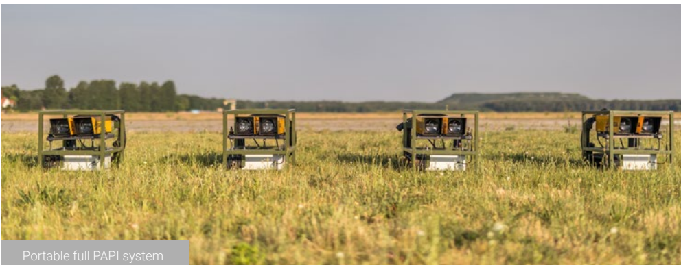
Portable full PAPI system