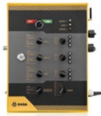
UR-201 CONTROL & MONITORING UNIT