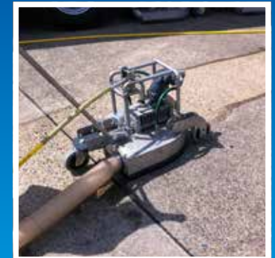
Small inaccessible areas can be handled with the hand cleaner MCD 360 (optional).

additionally thus it can be worked in the ongoing traffic and on the right as well as left of the track.