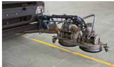
Removal device in front of the truck in lifted position