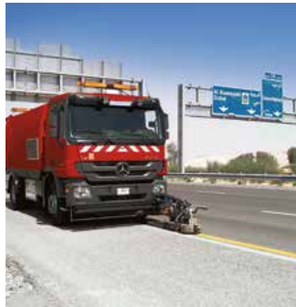
MRT 300/2 in operation in Dubai