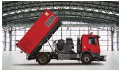
Easy access to all aggregates for services, when vessel is tipped upwards.