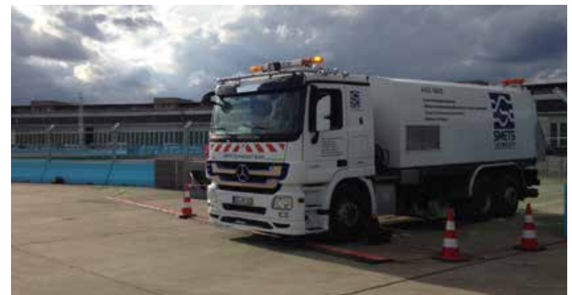
Demarking after Formula E , Berlin Tempelhof 2018