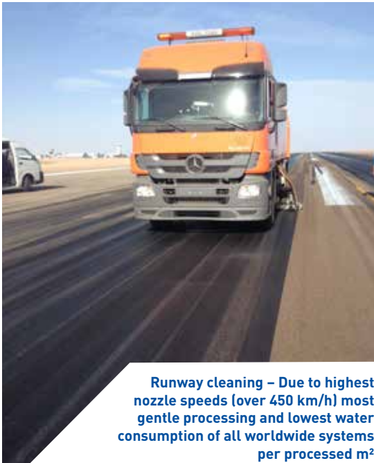
Runway cleaning – Due to highest nozzle speeds (over 450 km/h) most gentle processing and lowest water consumption of all worldwide systems per processed m 2

Please ask for our offer for your special problem.