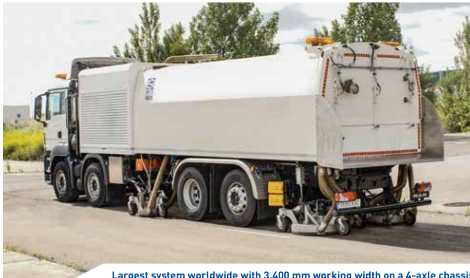
Largest system worldwide with 3,400 mm working width on a 4-axle chassis

If the early warning level is ignored, the system switches off at Reaching even more critical values at warning level RED and the whole system will be deactivated.