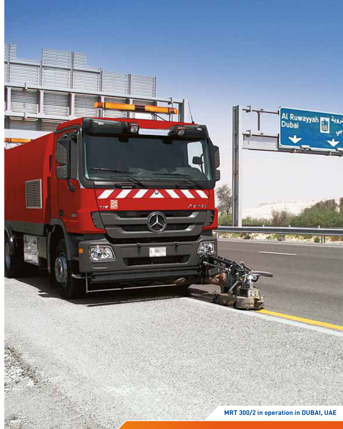
MRT 300/2 in operation in DUBAI, UAE