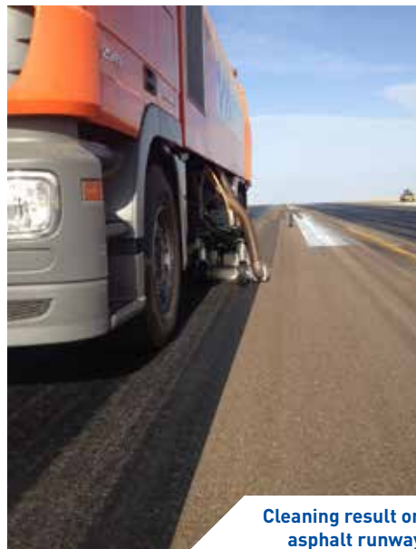
Cleaning result on asphalt runway